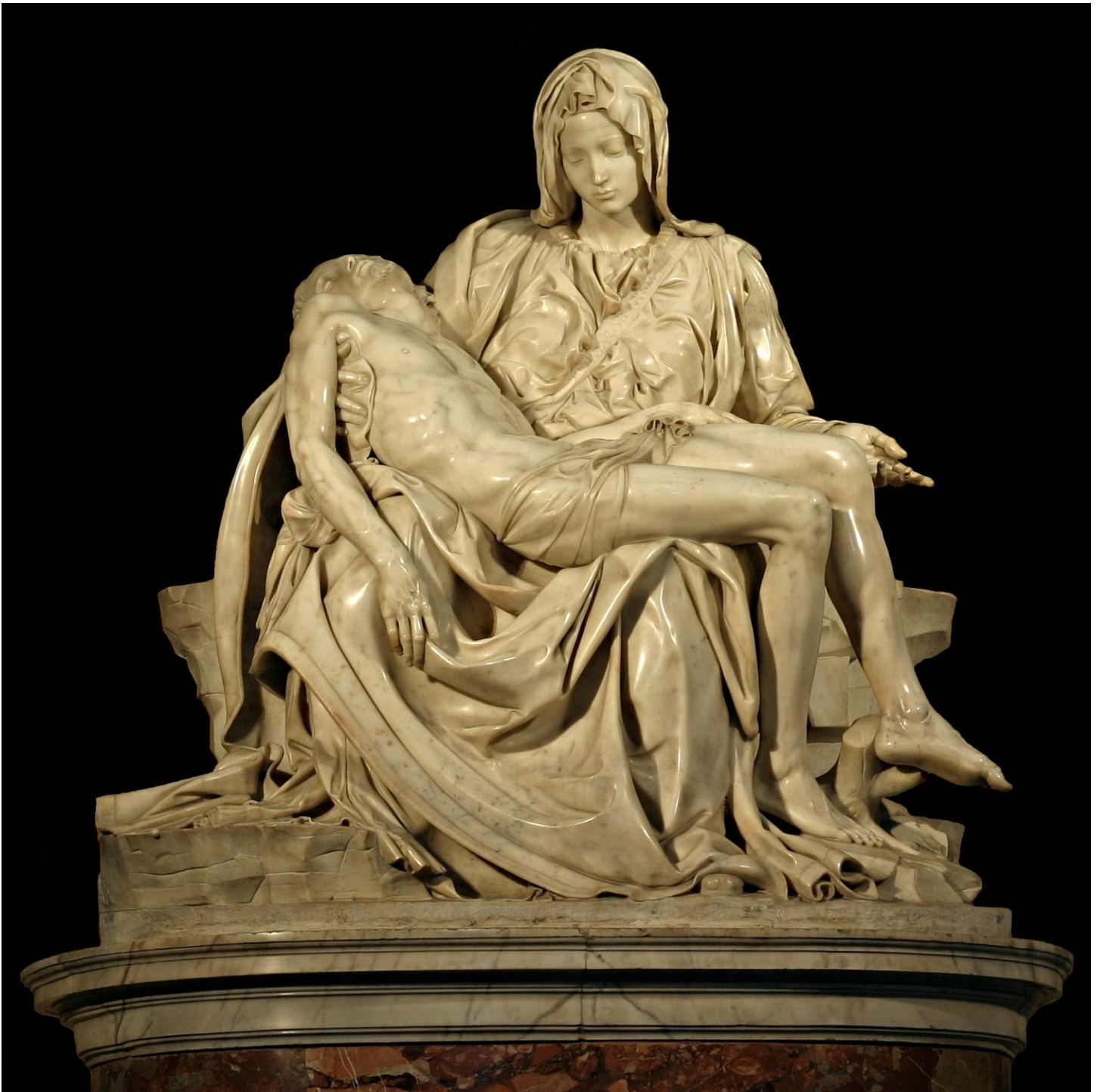
The Pietà by Michaelangelo

Notice those words again. He declares, “When we reflect how often the Church has skillfully contrived to plant the seeds of the new faith on the old stock of paganism, we may surmise that the Eastern celebration of the dead and risen Christ was grafted upon a similar celebration of the dead and risen Adonis, which . . . was celebrated in Syria at the same season.” (p. 401).