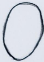
Pope Johanna 855-857