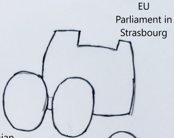
EU Parliament in Strasbourg