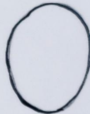
Otto the Great 962-973