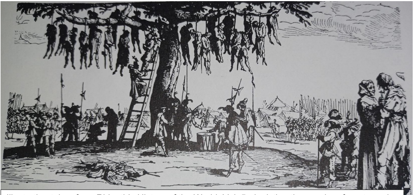
Illustration taken from Ridpath's History of the World, Vol. 5, depicting the murder of martyrs who would not worship the cross.