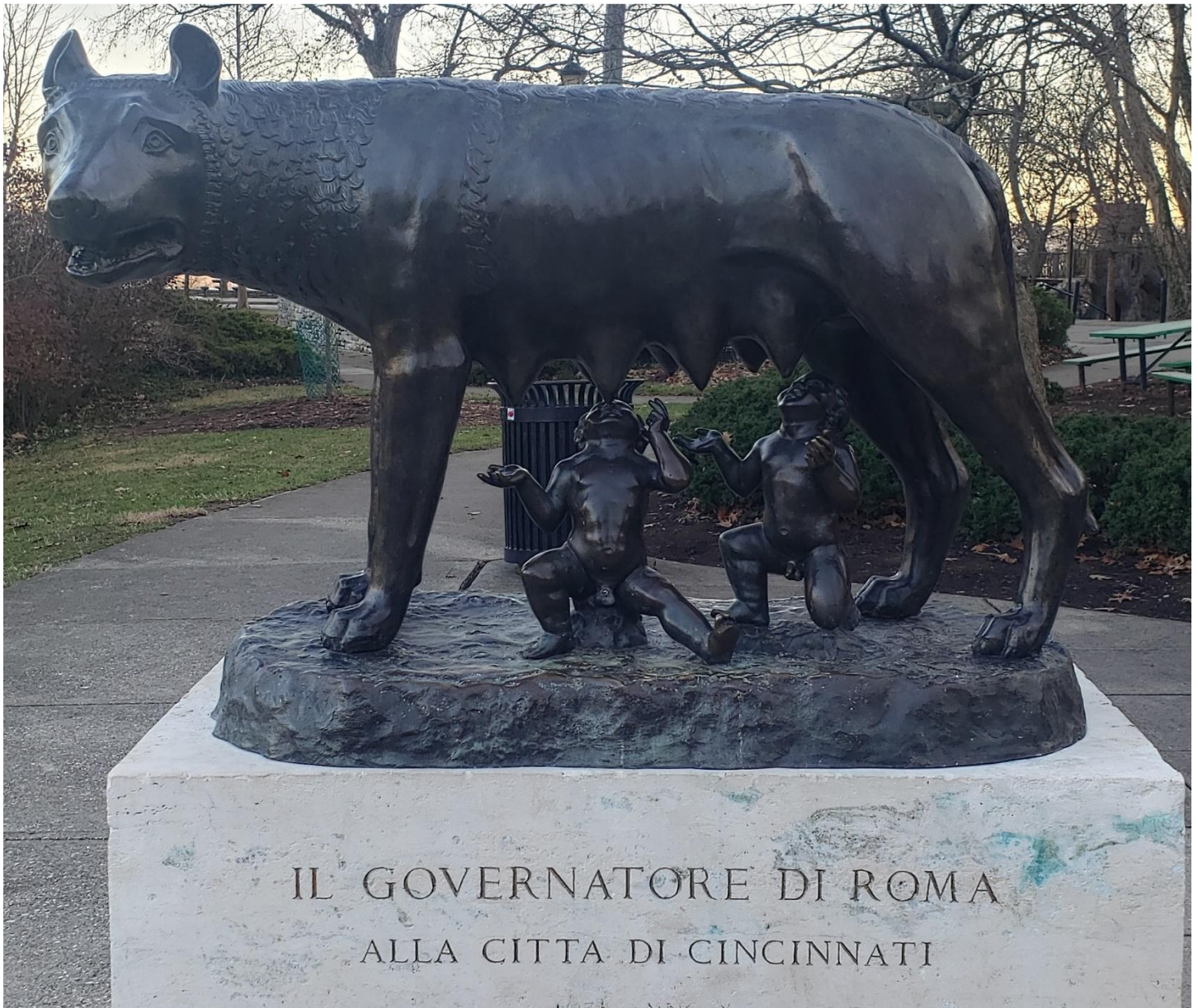
Statue depicting Romulus and Remus

The last “ruler” of a “holy” Rome Empire was Mussolini, who ruled under the phrase “Viva Il Duce”, this also adds up to 666, (V=5, V=5, I=1, L=50, D=500, V=5, C=100).